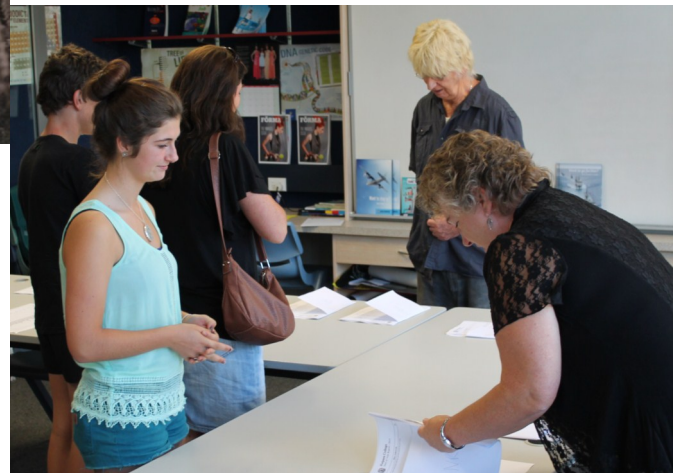
Above: Parents and students collect reports on Pathways reporting day.

Parents and caregivers who were unable to collect their child's report on Pathways Day may collect them up from the main office during college hours.