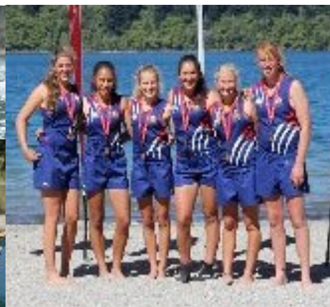
Above: 1st place and National Champions Under 16 mixed W12 250m