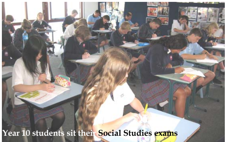
Year 10 students sit their Social Studies exams