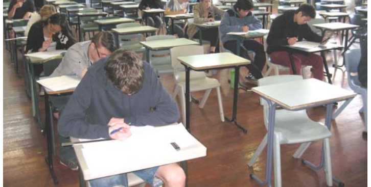
Year 13 students sit their Level 3 NCEA Accounting exams

While there are many ways students have their work assessed these days, there are still old fashioned, sit at your desks in silence, examinations. What would New Zealand secondary schools be without their November exam season?