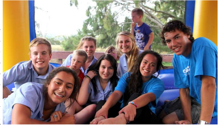
Above: Volunteers at Children's Day Out. (Thought you had to be under 12 to go on the bouncy castle).