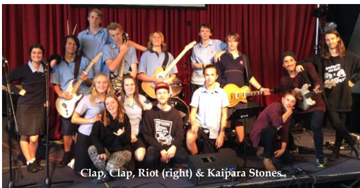
Clap, Clap, Riot (right) & Kaipara Stones.

Kaipara musicians have been invited to perform at the tribute concert for Rolling Stones music. On Thursday Clap, Clap, Riot was at school rehearsing and playing with our bands who will join them for two Stones numbers.