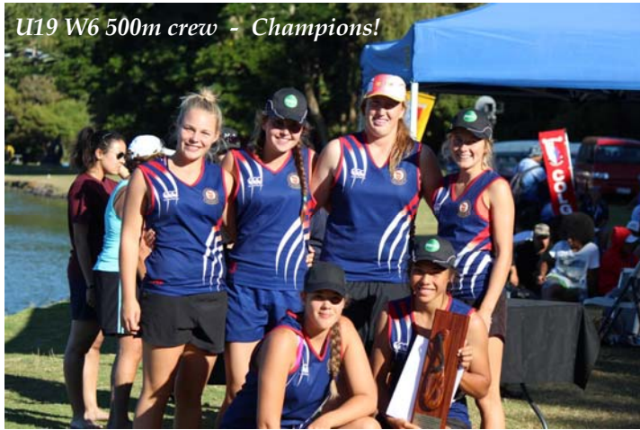
U19 W6 500m crew - Champions!