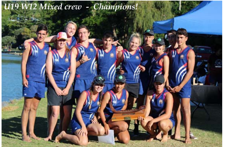
U19 W12 Mixed crew - Champions!