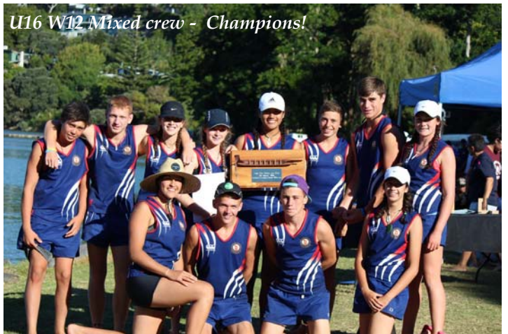
U16 W12 Mixed crew - Champions!